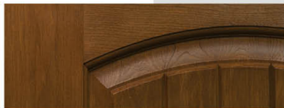
FR - Fiberglass Rustic Cherry (OGEE)