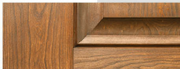
FC - Fiberglass Traditional Cherry