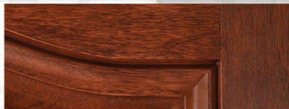
FM - Fiberglass Mahogany