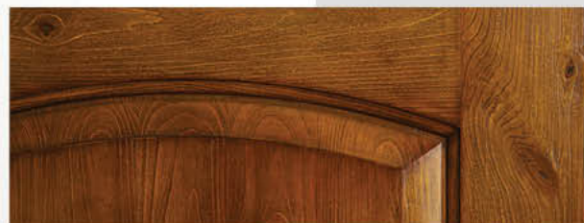
FK - Fiberglass Knotty Alder