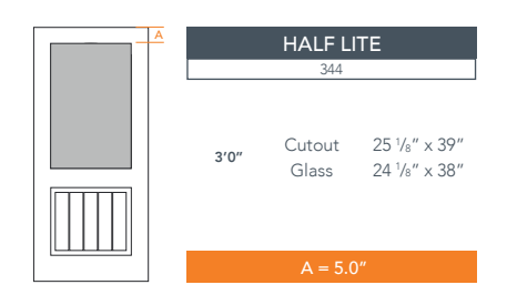
\mathbf{A} = \mathsf{DISTANCE} FROM TOP OF DOOR TO TOP OF OPENING